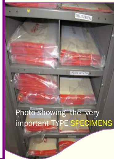
Photo showing the very important TYPE SPECIMENS