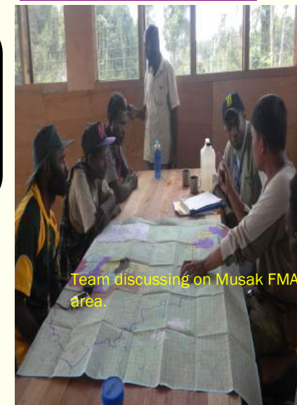
Team discussing on Musak FMA area.