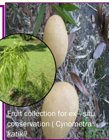
Fruit collection for ex-situ conservation (Cynometra katikii)

Forest Biology Program continues to ensure that PNG's flora is well documented and proper updated identifications are done to the 300,00+ and 2335 TYPE plant specimens collected and stored at the herbarium whilst maintaining the operations of the Lae Botanical Gardens for the benefit of the public.