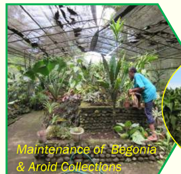
Maintenance of Begonia & Aroid Collections